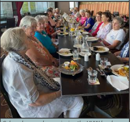
Caloundra members enjoying the VHW lunch