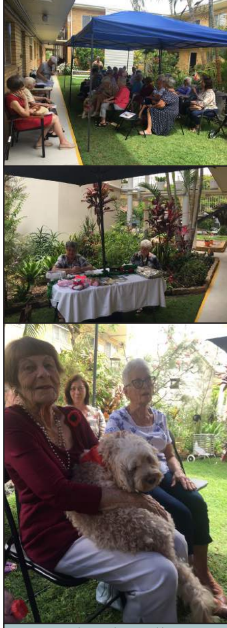
New Farm members at their monthly meeting with "Prince"

A safe and happy Merry Christmas to all.