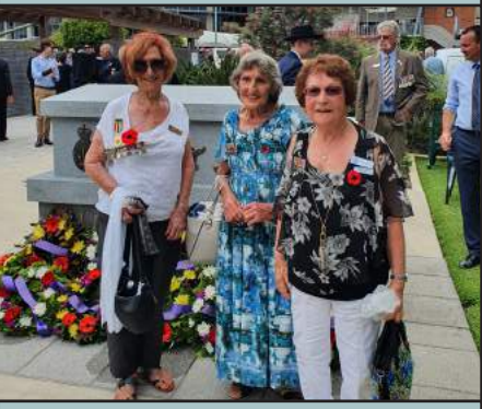
Remembrance Day Service in Caloundra