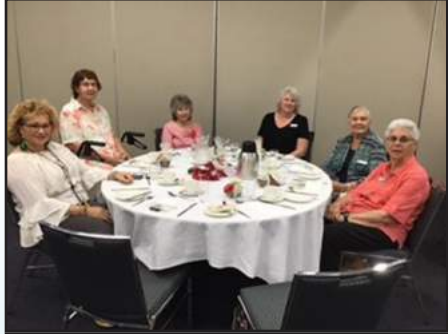
Townsville members enjoying lunch