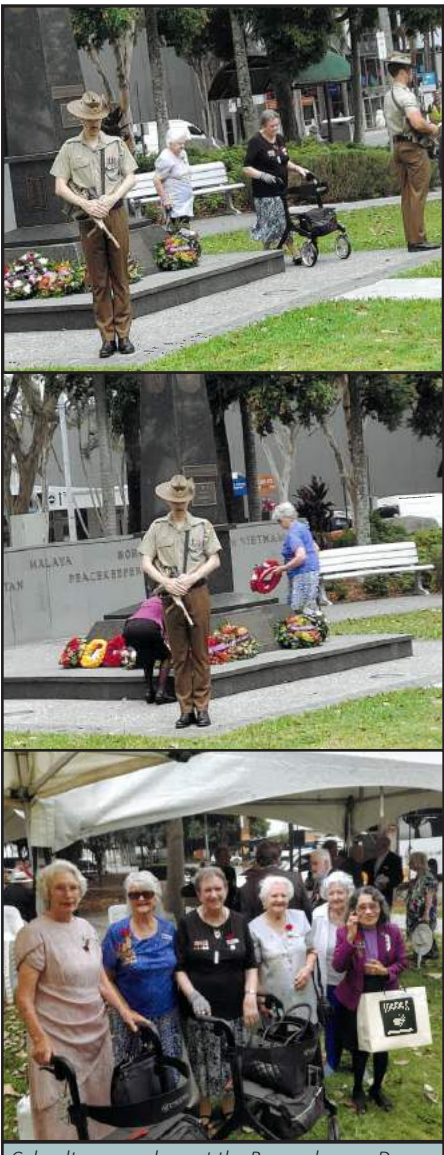
Caboolture members at the Remembrance Day Service

To our fellow AWWQ members, we look forward to catching up at the Christmas Luncheon and wish you all health and happiness in 2022.