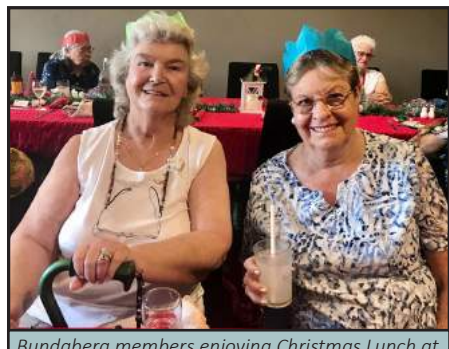
Bundaberg members enjoying Christmas Lunch at the Rowing Club