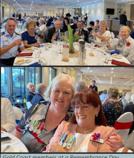
Gold Coast members at a Remembrance Day Lunch